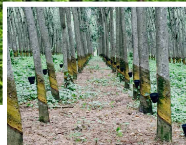
“Hevea Brasiliensis” also known as Rubber Trees.