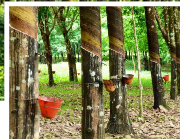
With a thin diagonal cut the bark is removed. Over six hours the sap drips out, like blood. A couple of days later when the tree has recovered, the procedure repeats.