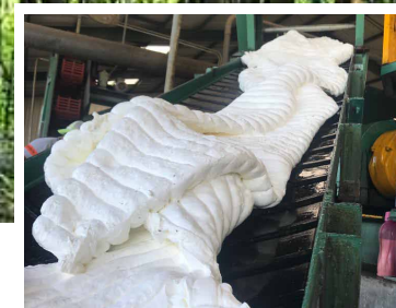
After removing impurities, formic acid helps to coagulate the sap into a workable consistency.