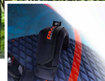
Brought to the facilities in Thailand, the sheets are die cut and manufactured into new footstraps. During 2020 season all boards will come with the Yulex foot straps.