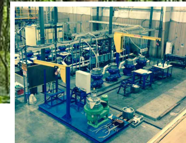
The coagulated rubber runs through the final step before becoming sheets of Yulex certified foam.