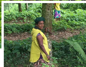
Sustainably and responsibly grown in Guatemalan and Sri Lankan plantations, certified by the Forest Stewardship Council (FSC).